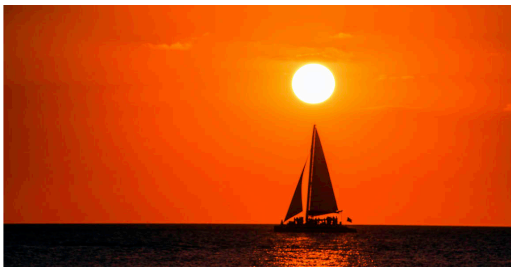
Cover photo "Sailing Under the Setting Sun" by Charles Patrick Ewing is licensed under CC BY 2.0.