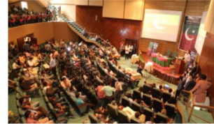
PTI Launches Its National Digital Policy