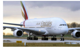
The World's Largest Passenger Plane Will Land in Pakistan This Week

As a follow up of this expedition, SCSIO and NIO have plans to organize a Joint scientific conference during first week of February 2018 to share preliminary results with the scientific community, academia and oil/gas industry.