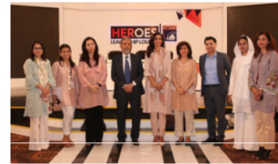
Unilever Pakistan's HEROES Mentoring Program Focuses on Work-Life Balance